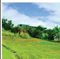
MLS# 280900 1230 Pua Melia Street, Kalaheo Listing Price: $299,000 Approximately 10,804 sq/ft Phase 1, Lot #49

Houses in front of this lot have been built and allows buyer to design a home to capture all the ocean and mountain views.