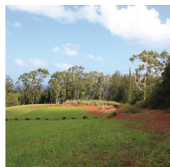
MLS# 283145 Kua Aina Street, Kalaheo Listing Price: $327,500 Approximately 10,181 sq/ft Phase 3, Lot #37

Corner lot with ocean and coastline views.