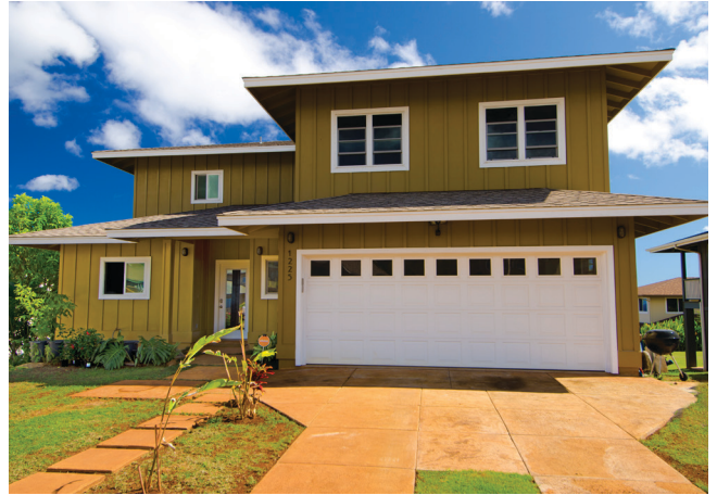
MLS# 285608 Listing Price: $1,249,000 1225 Nohea Street, Kalaheo 4 BD, 3.5 BA

This well-constructed, family-orientated home has 4 bedrooms with 3.5 baths. Large master suite with valley, mountain and ocean views. Second master on main level can be used as a guest suite and was designed as one floor living with a large garage, kitchen, laundry room, dining room, living room and large lanai all on one level. Custom touches throughout the home.