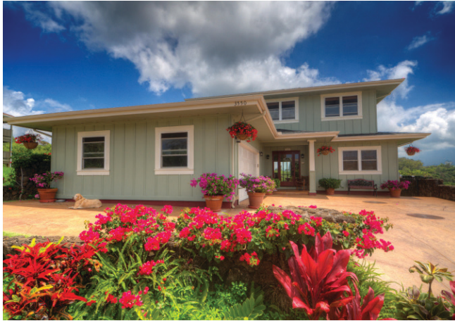
MLS# 283380 Listing Price: $949,000 3550 Kakela Makai Drive, Kalaheo 4 BD, 3.5 BA

This well-constructed, family-orientated home has 4 bedrooms with 3.5 baths. Large master suite with valley, mountain and ocean views. Second master on main level can be used as a guest suite and was designed as one floor living with a large garage, kitchen, laundry room, dining room, living room and large lanai all on one level. Custom touches throughout the home.