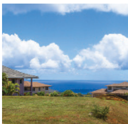
MLS# 193964 1248 Nohea Street, Kalaheo Listing Price: $375,000 Approximately 11,698 sq/ft Phase 2, Lot #18

Corner lot with ocean and coastline views.